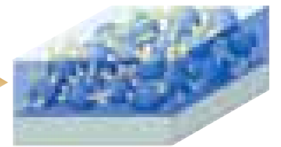
In the reaction, the paint layer consists of epoxy structure is formed to enhance the durability and water resistance of the film.